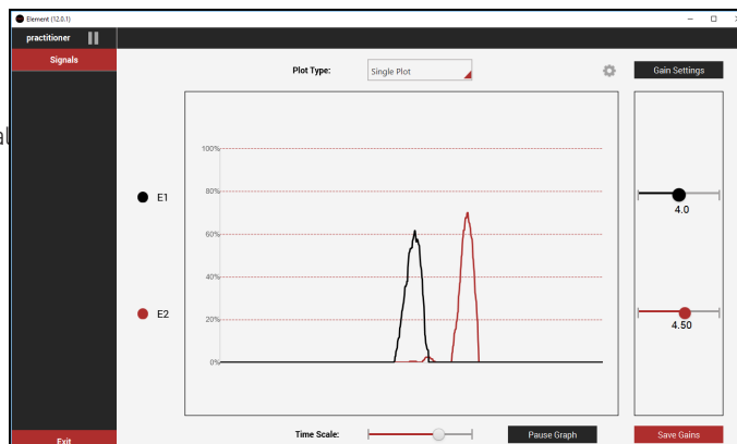
Element desktop software