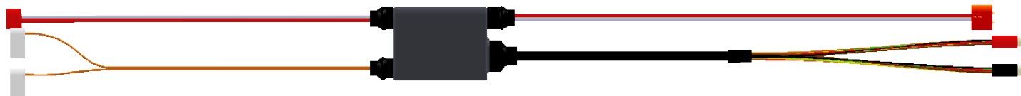
Signal Processing Box